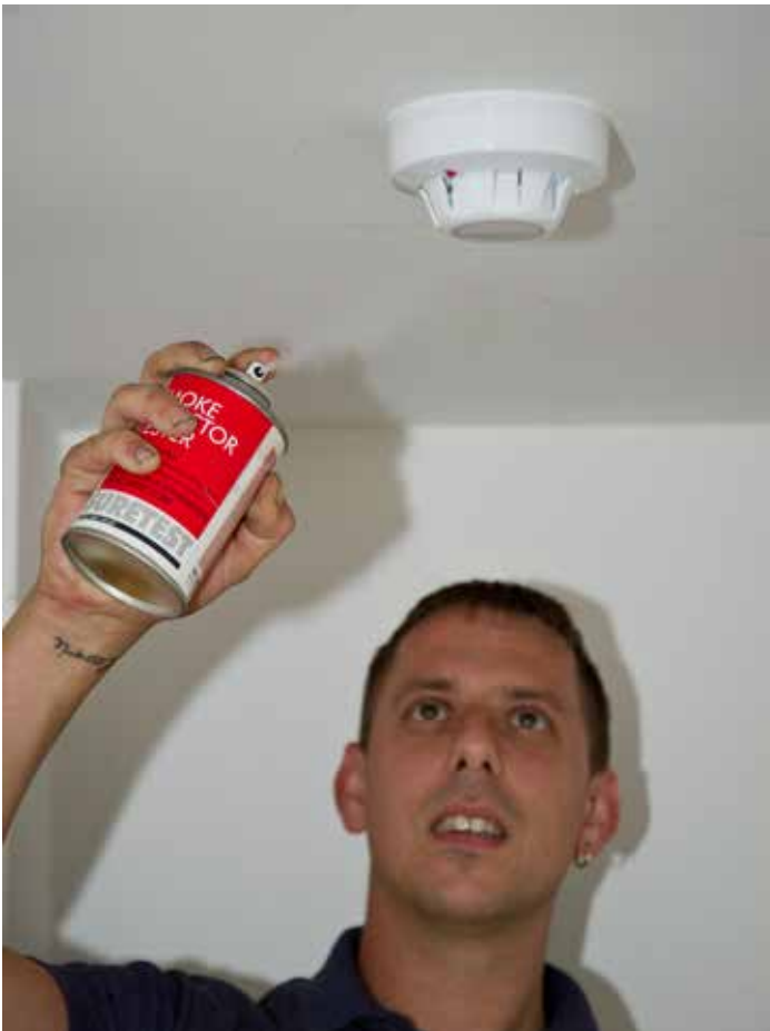
Figure 11 Weekly test of fire detection system

Fixing the issues surrounding MCPs and false signals generated from ARCs would lead to the reduction of false alarms by approximately 20% (this estimate comes from both this and the previous BRE false alarm study).