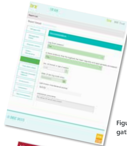
Figure 2: BRE UFAS data gathering tool

Over the duration of this study the fire alarm investigator periodically produced detailed qualitative reports for the stakeholder group, which provided anecdotal accounts of his observations and findings.