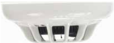
Figure 5: Optical/heat multi-sensor detector

Further research is required to support or recommend the use of multi-sensor detectors, and to identify their performance variabilities and capabilities. The findings should then be used to support codes of practice or building regulations.