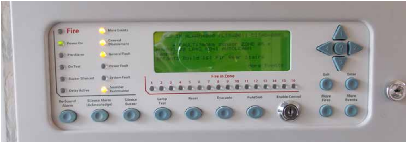
Figure 15: Example of panel in fault and isolate condition