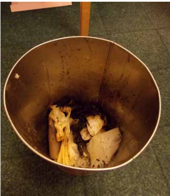
Figure 16: Fire in a bin from a smouldering cigarette

Clearly, in these cases, if the FRS had a policy of not responding to unconfirmed fires then the situation would have been a lot worse. These examples demonstrate the benefits of correctly installed detectors and a rapid response by the FRS.