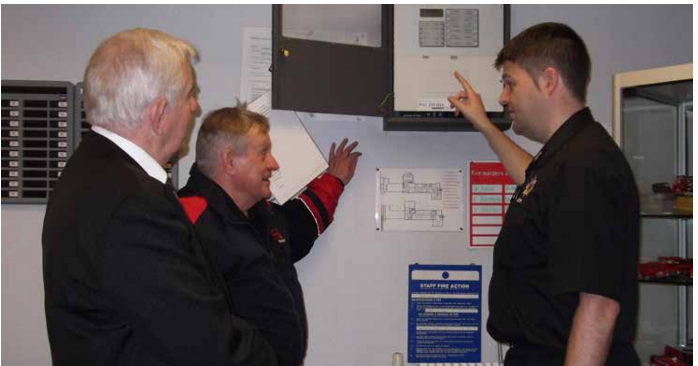
Figure 4: Fire Alarm Investigation