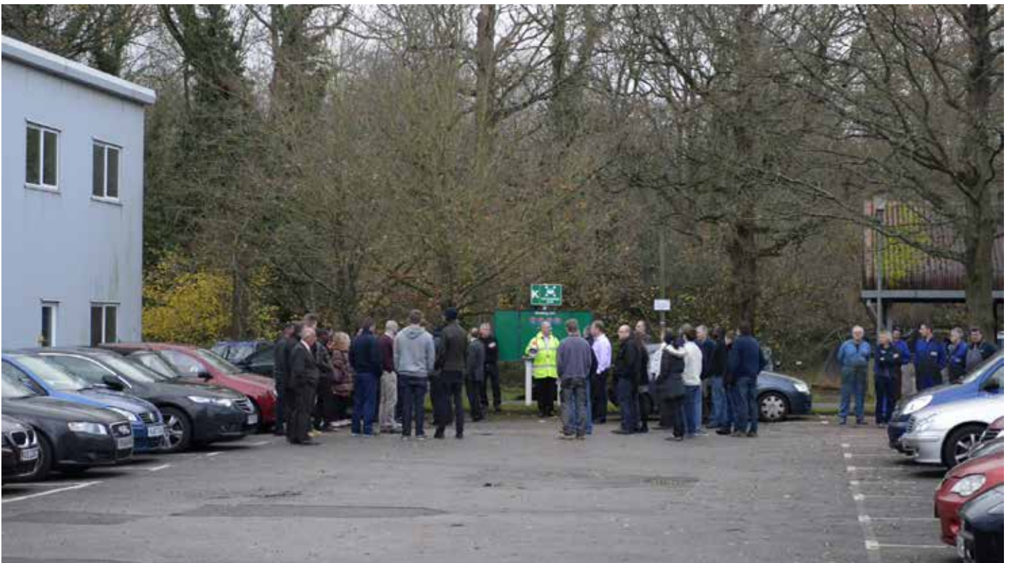
Figure 1: Business disruption during a false alarm

Following a multi-agency briefing to the Scottish Fire and Rescue Service Board a more thorough investigation of false fire alarm causes was proposed, leading to this research work which has been carried out by BRE in conjunction with the SFRS and with the support of a number of stakeholders.