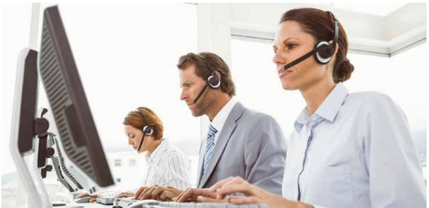
Figure 10 Alarm Receiving Centre

In addition some false alarms arise from accidentally trying to use an MCP to release an electronically locked door, rather than the normal control provided for this purpose, or the emergency override. An emergency override normally takes the form of a green fire alarm call point (see Figure 9). BS 7273-4 [6] recommends that, where a green 'break glass' unit is likely to be used by persons other than trained staff, there should be a sign next to it saying, "In emergency, break glass to open door", to distinguish it from a fire alarm call point.