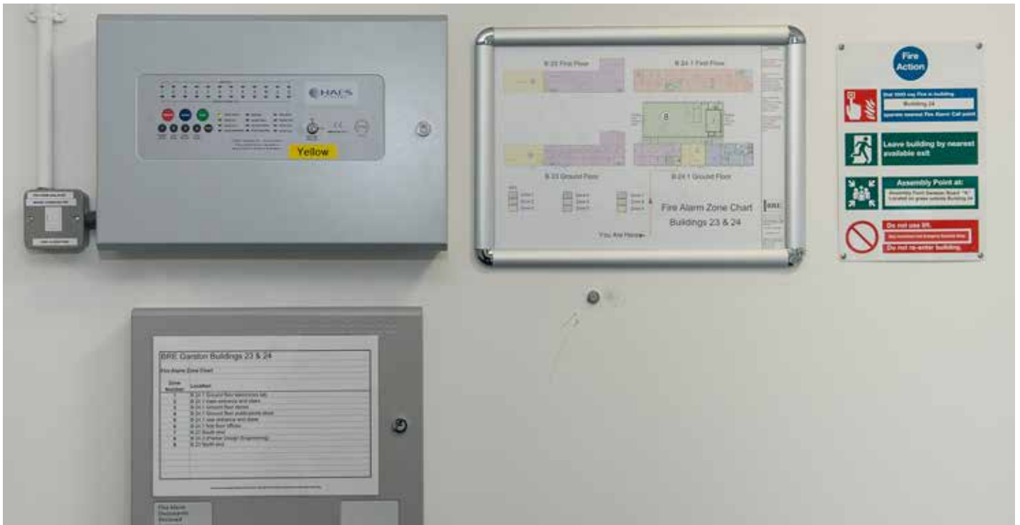
Figure 17: Good maintenance – the control panel is in quiescent mode (no faults or isolations), the logbook present and zone plan up-to-date