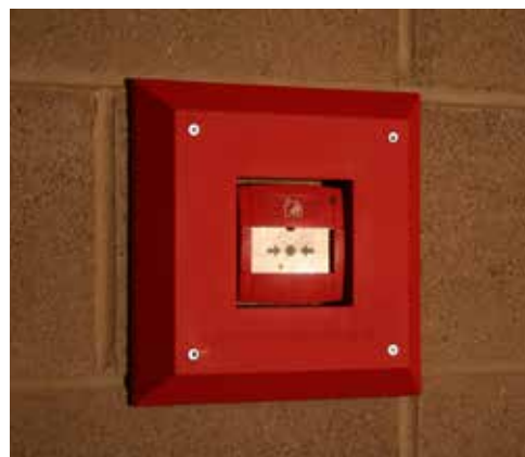
Figure 8: Protective shielding for manual call points

The product standard EN 54-11 [5] has an impact test in which a chamfered hammer strikes the outer edges of the MCP, once from the side and once from the front, with impact energies of 1.9J. This is considered adequate for most applications and even though the impact energy from a trolley is much greater than this, there is no need to recommend higher levels in the standard as these are extreme applications and exposures that are not typical of most service environments.