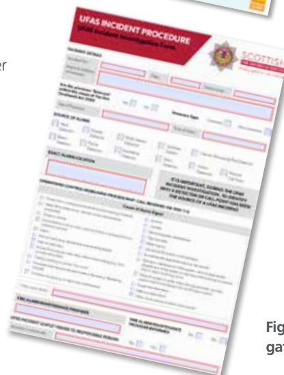
Figure 3: SFRS form used for gathering detailed UFAS data