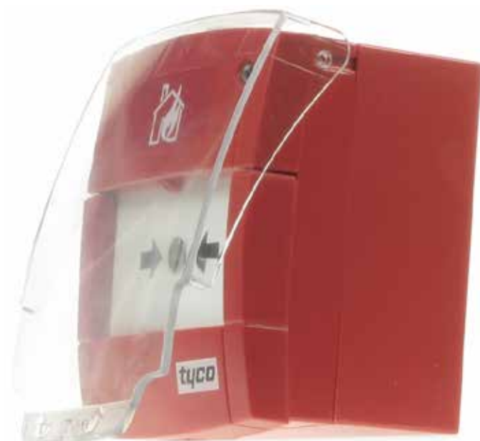
Figure 7: Manual Call Point with protective cover

Further research work with used smoke detectors from different service environments is proposed to identify any changes in detector performance. This would provide valuable data and identify whether smoke detectors in the field are getting less sensitive (thus effectively outside the approved limits) or more sensitive making them more likely to cause false alarms.