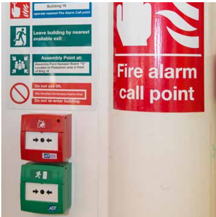
Figure 9: Manual call points for fire and for emergency door release

In addition some false alarms arise from accidentally trying to use an MCP to release an electronically locked door, rather than the normal control provided for this purpose, or the emergency override. An emergency override normally takes the form of a green fire alarm call point (see Figure 9). BS 7273-4 [6] recommends that, where a green 'break glass' unit is likely to be used by persons other than trained staff, there should be a sign next to it saying, "In emergency, break glass to open door", to distinguish it from a fire alarm call point.