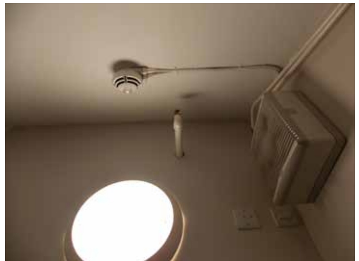
Figure 6: Poorly placed optical smoke detector

False alarms were not observed from aspirating smoke detectors, but there was one anecdotal account of activation from aerosol spray. A greater sample size would be required to identify more accurately the proportion of false alarms generated by the other less frequent offenders, such as linear heat detectors, ionisation smoke, carbon monoxide and optical beam smoke detectors. When reporting false alarms using the IRS, no distinction is made between optical point smoke, optical beam and aspirating smoke detectors which are classified under the generic heading "smoke detectors".